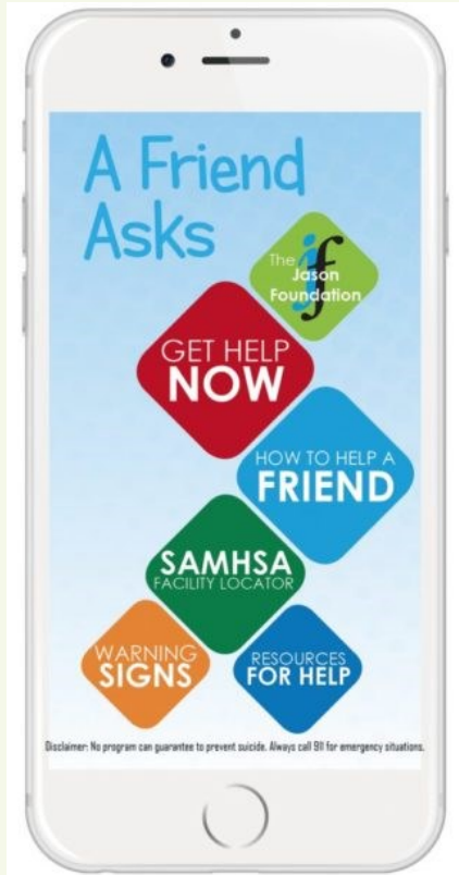
FREE Suicide Prevention App for youth